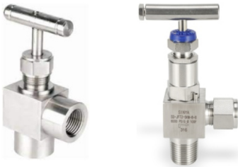
Threaded Threaded x Tube End